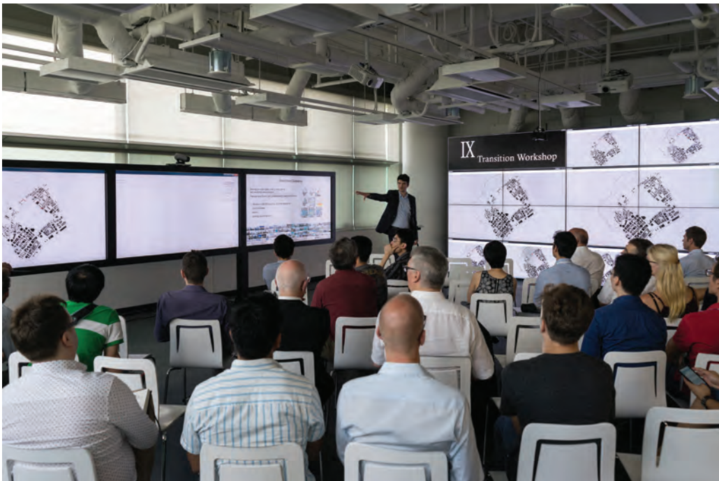
Fig. 04 Simulated Design Workshop during the Transition Workshop. The Touchwall on the left side shows the 3D Map navigation, panels for the Selforganizing maps for street and building layouts and input panels for the optimization process. The video wall on the right side shows a planning site at Pungol in Singapore for different measurement criteria.