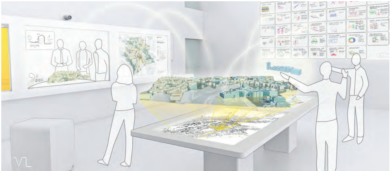
Fig. 01 Human - computer interaction concept of the evolutionary multi-criteria optimization tool adapted to the ValueLab Asia