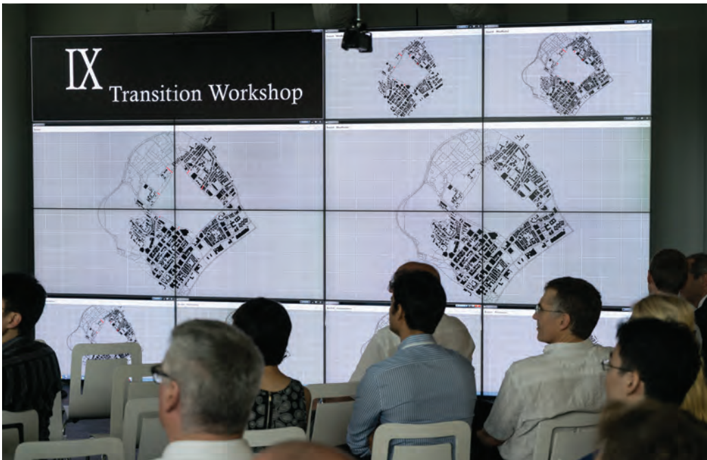
Fig. 05 The videowall shows a building layout proposition for the isovist, sunexposure and other measurements.